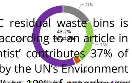
Recyclables in residual waste North Herts

3.12. The proportion of food waste in EHC residual waste bins is significant at 29.9%. Food production, according to an article in the professional magazine 'New Scientist' contributes 37% of global greenhouse gases and a report by the UN's Environment Programme estimates that between 8% to 10% of greenhouse gas emissions are from food which is wasted. Campaign work to encourage behaviour change in EHC and NHC over recent years and ongoing is only part of the solution to managing food waste.